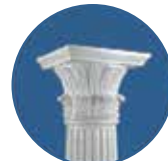
Temple of Winds